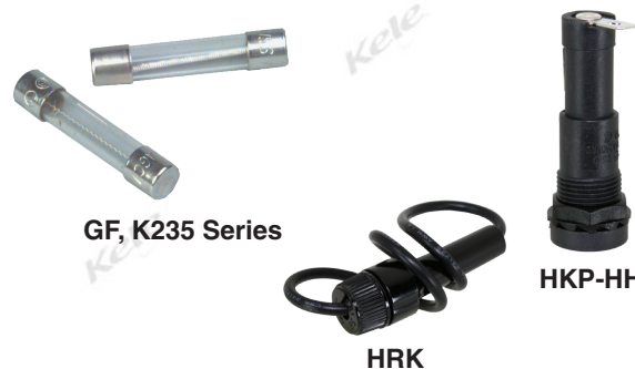
GF, K235 Series